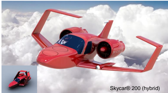
Skycar® 200 (hybrid)

Analysis shows that to meet these objectives [6], a hybrid flying car would derive most of its power during vertical takeoff from batteries. To be landable at the curb it must reduce its size prior to landing. This will limit the size of the propulsion system's sweep area and increase the